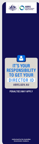
director ID web banner (vertical).jpg