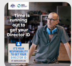
Who is a director?.jpg

#DirectorID #ausbiz #companydirector #ATO #ABRS