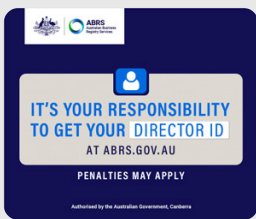
director ID web banner (horizontal).jpg