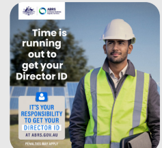
Why you need a director ID.jpg

#DirectorID #ausbiz #companydirector #ATO