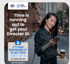
What is a director ID?.jpg

#DirectorID #ausbiz #companydirector #ATO #ABRS